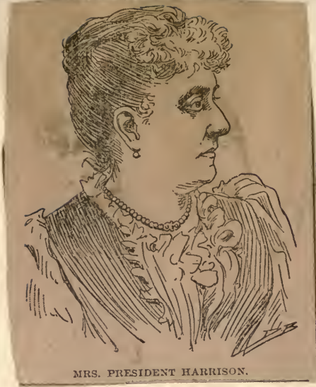
MRS. PRESIDENT HARRISON.

Entered according to Act of Congress, in the year 1876, by GEO. FISHER & CO., in the office of the Librarian of Congress, at Washington.